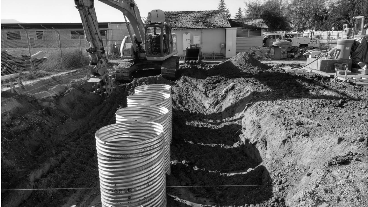
Cross Town Pipeline Booster Station