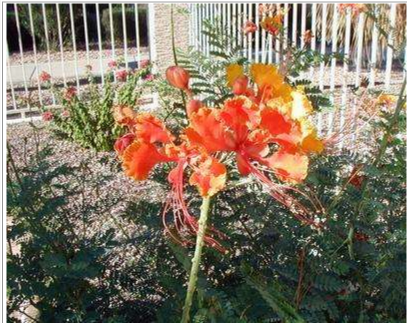
The flower of the Red Bird of Paradise .

Below are pictures of purple sage bushes, a common evergreen bush found in the Phoenix area. The purple sage is one of seven plants that you can use in your desert landscape yard that is easy to grow, easy to care for, and looks good all year long.