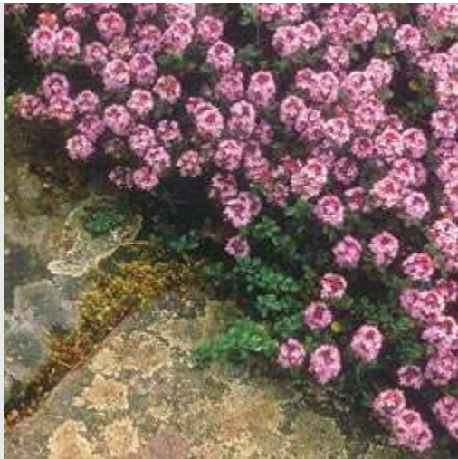
Thymus pseudolanuginosus (Woolly Thyme)

Lychnis chalcedonica (Maltese cross) is another stunning red-flowered perennial. It comes to us from northern Europe and Russia, making it hardy to zone 4. Its stiff, hairy, 1-metre (3 ft.) long stems grow from a basal clump of mid-green leaves that clasp the stems with heart-shaped bases, while summer’s scarlet flowers are each shaped like a Maltese cross. If you are planning a red border, place this close to Crocasmia ‘Lucifer’ for a real showstopper.