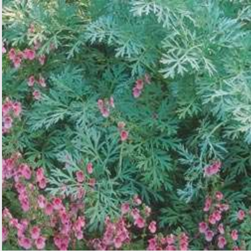
Artemisia absinthium 'Lambrook Giant'

Another well-known old-fashioned member of the family. Lychnis coronaria (rose campion) is hardy to zone 4, a tremendous self-seeder and very drought tolerant. Friends who garden up the coast on Thormanby Island, which gets crispy-dry in the summer months, have this seeded about among the rocks where it thrives and appears to be deer proof! The silver-grey basal leaves are 18 cm (7 in.) in length. In late summer stems up to 80 cm (30 in.) long bear magenta flowers. Pure white forms are also available.