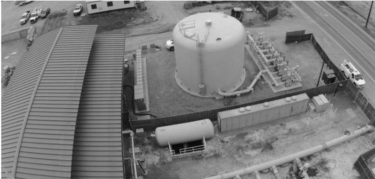
Lessalt Surface Water Treatment Plant Upgrade Construction