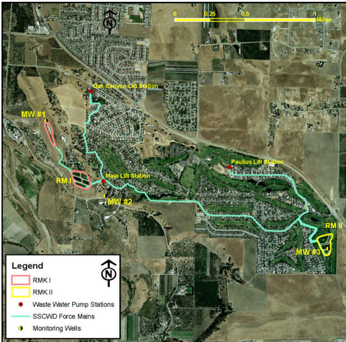
Figure 1-1: Ridgemark WWTP and Facilities

Wastewater effluent from these WWTP contains high salinity levels. Salinity concentrations in the potable water supply for the service area are already relatively high and are increased through normal municipal use. Salinity is further increased by the widespread use of residential water softeners in the service area which are used to reduce hardness. Salt buildup in the groundwater basin is a concern and salinity management measures are necessary to preserve the long-term beneficial use of groundwater.